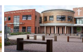
Nottingham Emmanuel School