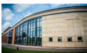
Bluecoat Aspley Academy

The growth of the Trust is a truly exciting time for prospective candidates who are looking to further their careers in a dynamic learning community that has opportunity at every point to share and learn from each other in order to become the best that we can be.