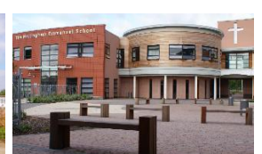
Nottingham Emmanuel School