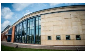
Bluecoat Aspley Academy

The growth of the Trust is a truly exciting time for prospective candidates who are looking to further their careers in a dynamic learning community that has opportunity at every point to share and learn from each other in order to become the best that we can be.