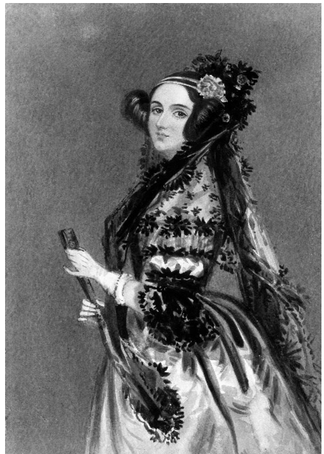
Ada Lovelace